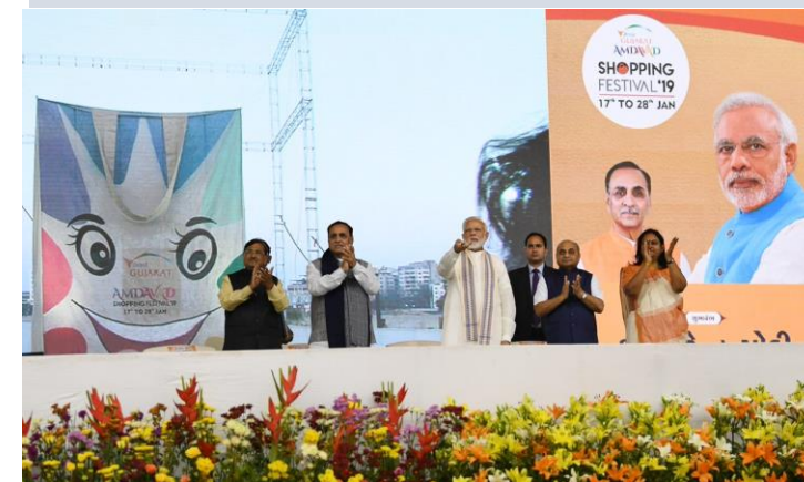
Inauguration of Amdavad Shopping Festival