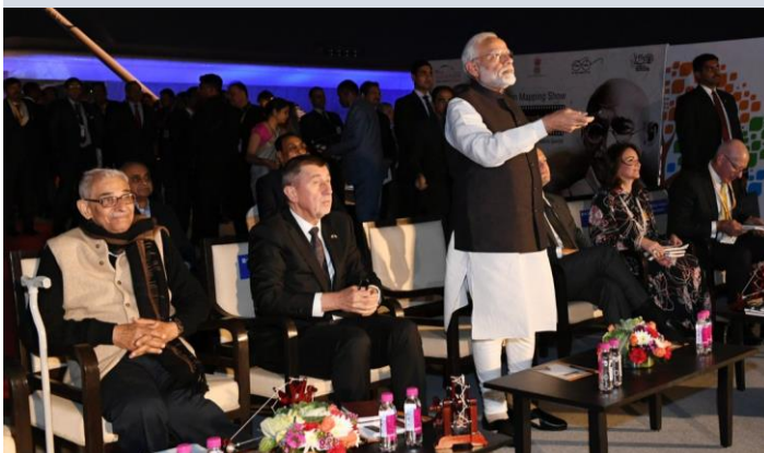
Inauguration of Sound and laser show at Dandi Kutir