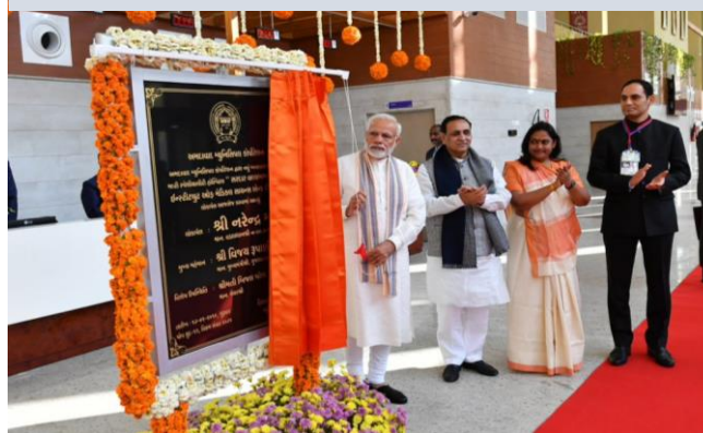
Inauguration of the Sardar Vallabhbhai Patel Institute of Medical Sciences and Research